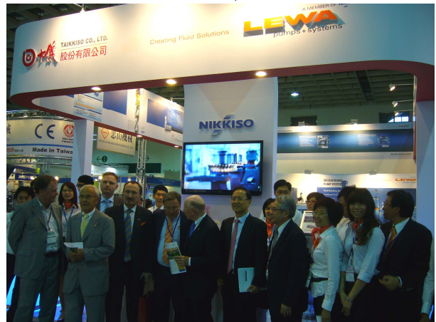
Booth LEWA GmbH / NIKKISO Group